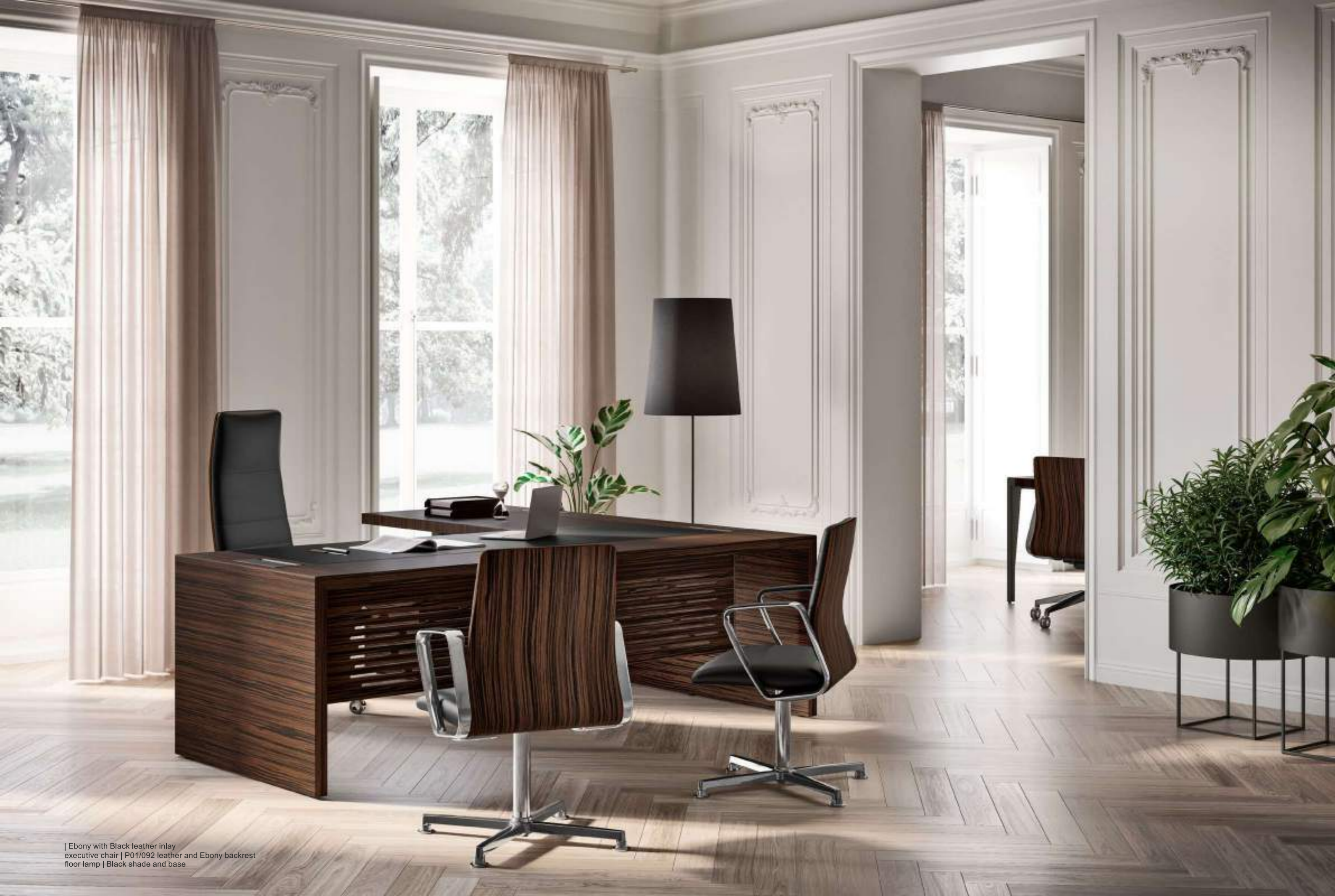
| Ebony with Black leather inlay executive chair | P01/092 leather and Ebony backrest floor lamp | Black shade and base