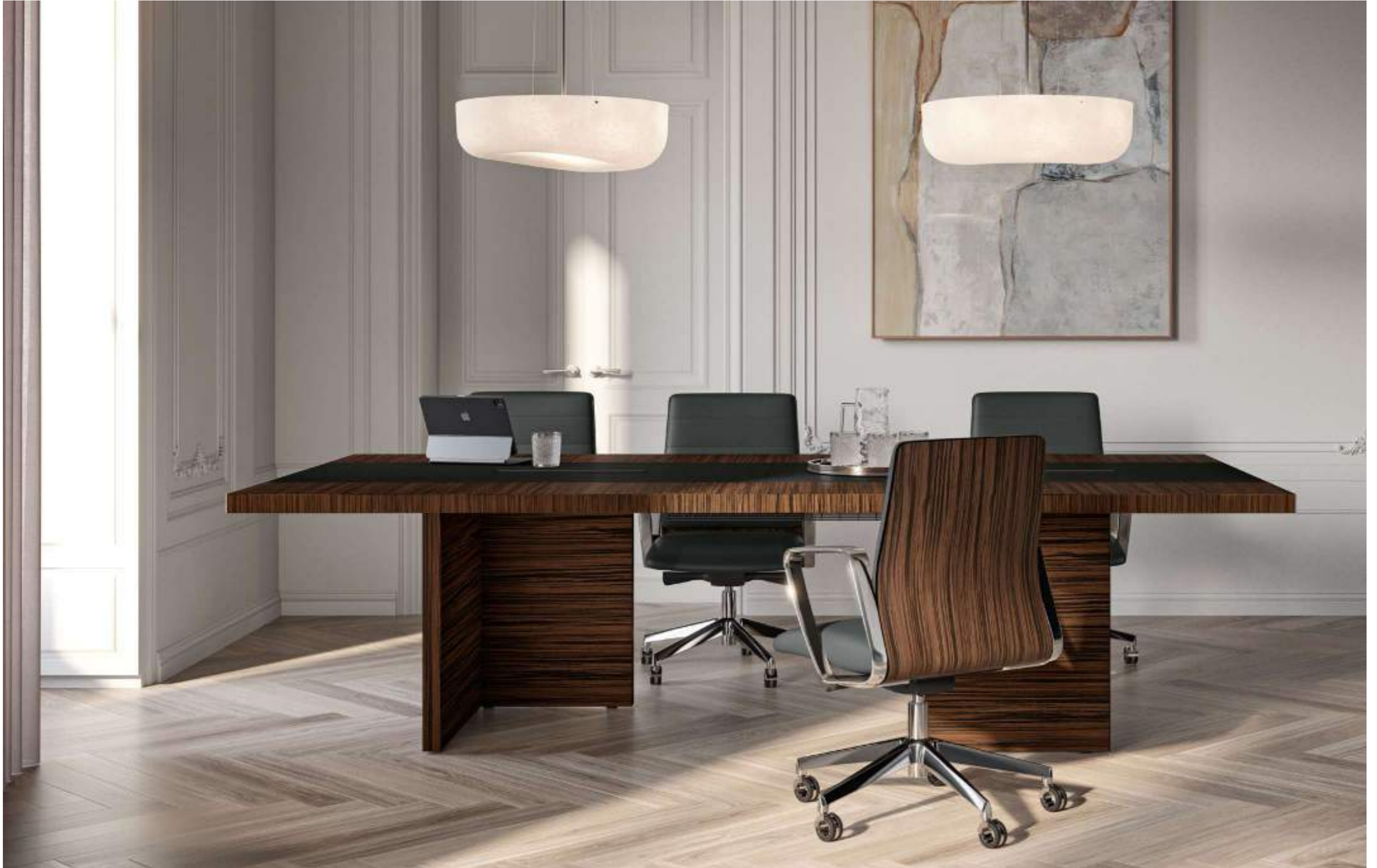
meeting table | Ebony with Black leather inlay executive chair | P01/092 leather and Ebony backrest pendant lamp | Matt White fibreglass