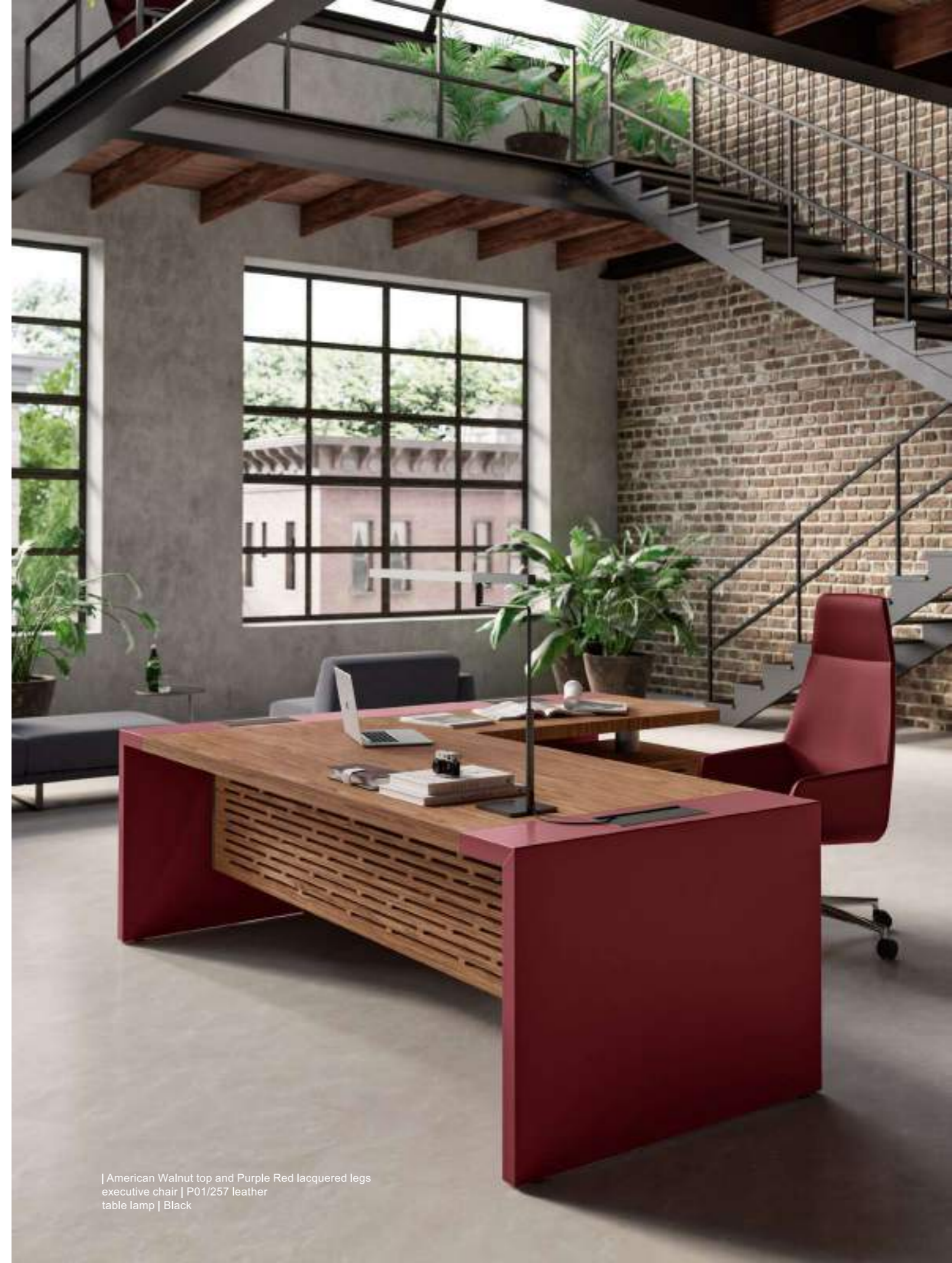
| American Walnut top and Purple Red lacquered legs executive chair | P01/257 leather table lamp | Black