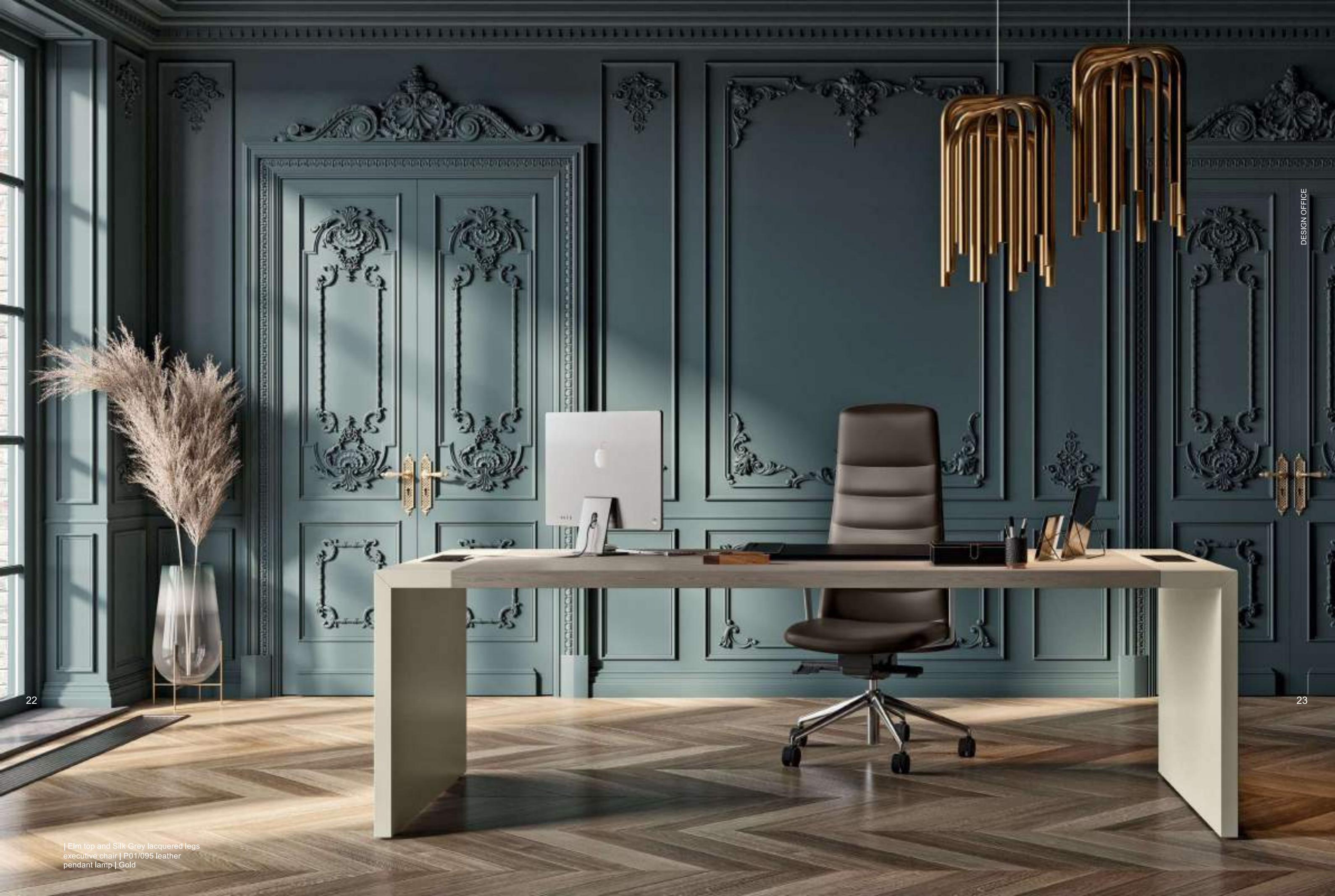
| Elm top and Silk Grey lacquered legs executive chair | P01/095 leather pendant lamp | Gold