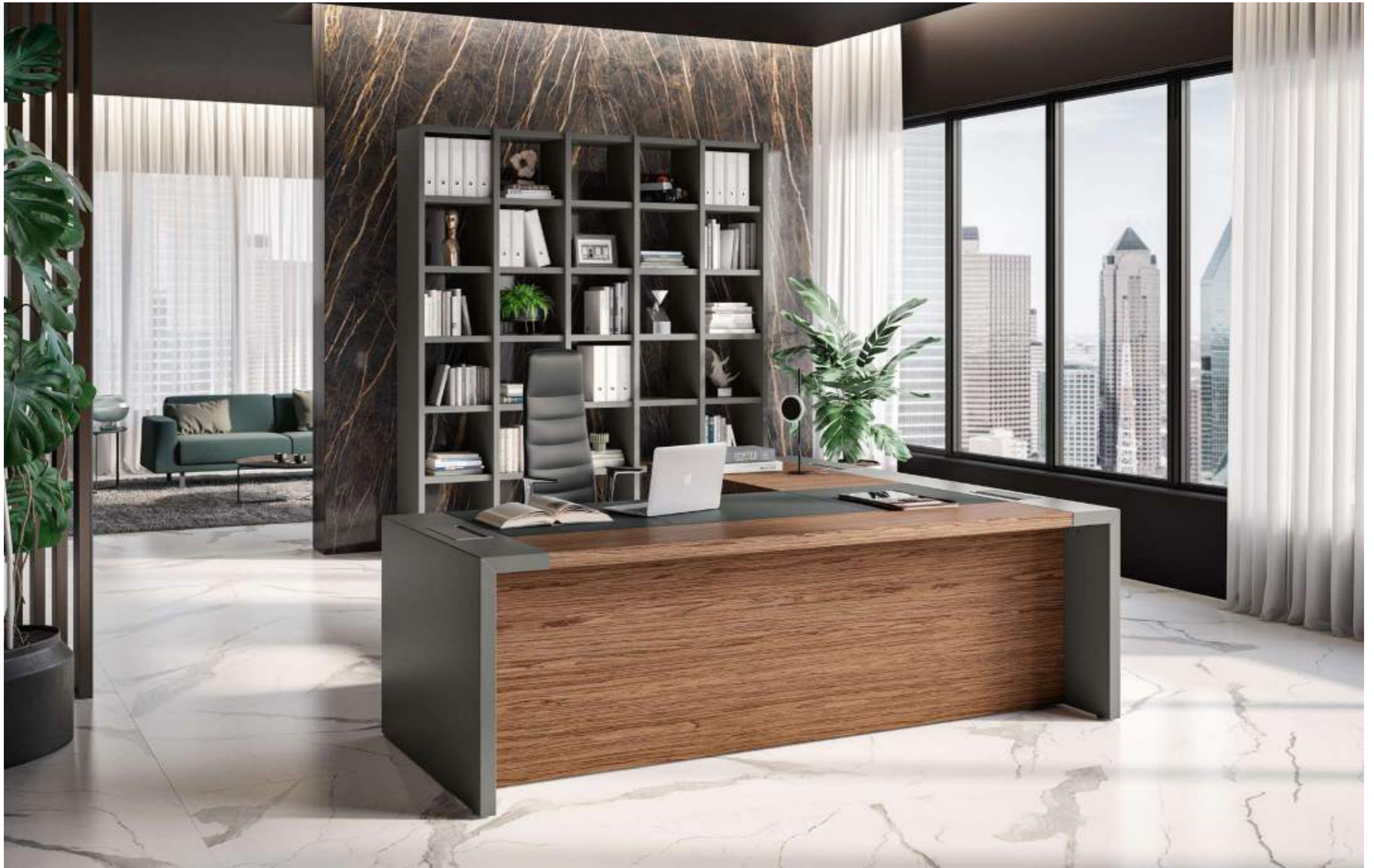
American Walnut top with Anthracite leather inlay, Umbra Grey lacquered legs executive chair | P01/172 leather bookshelves | Umbra Grey lacquer